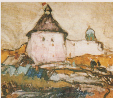
2. Evening 1968

Professor of Drawing at the Repin Academy, St. Petersburg and member of the St. Petersburg Union of Artists