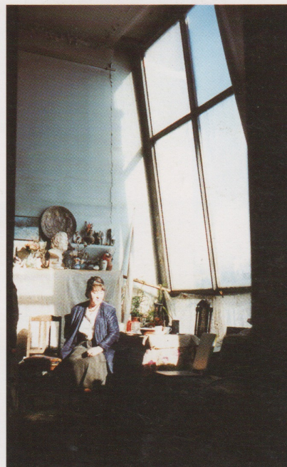
The artist in her studio, St. Petersburg 1997