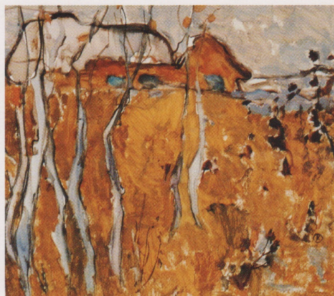
3. The Edge of the Forest 1969