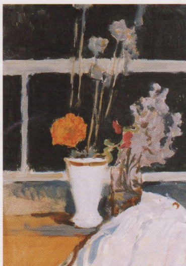
13. Still Life, Crimea 1988